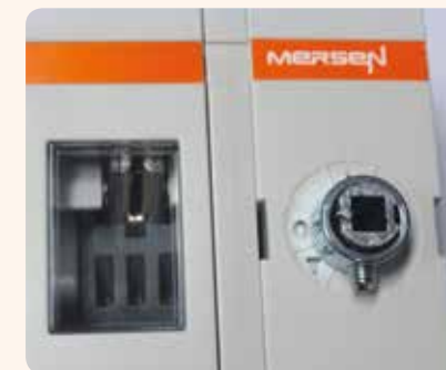
Safety: Window provides visible verification of position of switch.